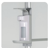
Sanitizing Dispensers Vol1