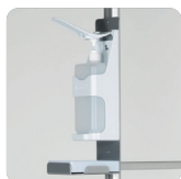
Sanitizing Dispensers Vol2