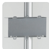
Box Dispenser Bracket