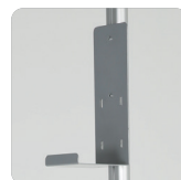
Pump Dispenser Bracket