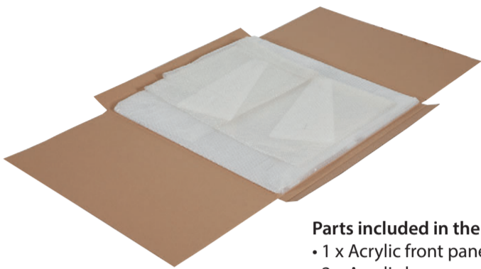
Parts included in the pack: • 1 x Acrylic front panel • 2 x Acrylic base