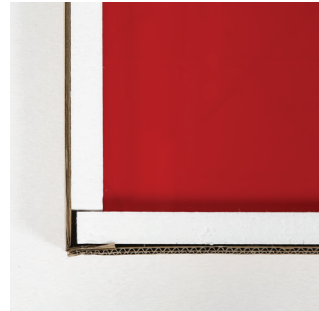
Rigid Corner protection.