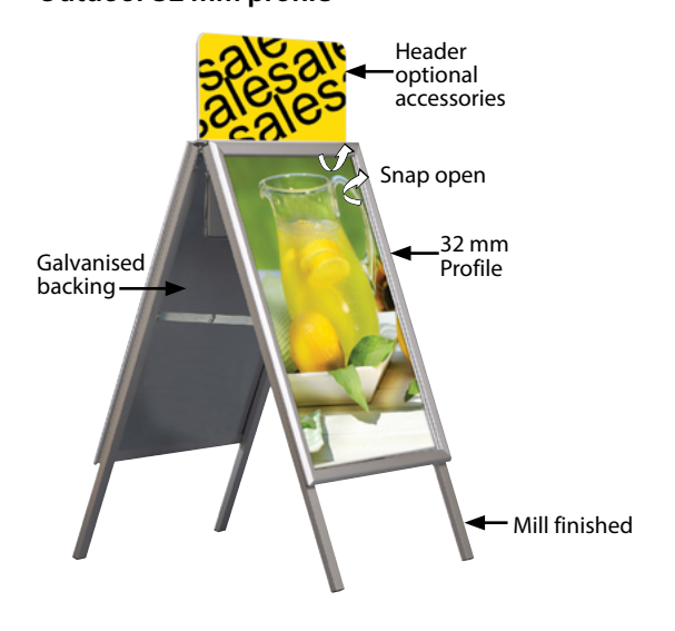
Outdoor 32 mm profile