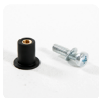
Optional well nuts (12 Pcs) UYSP00010X1000