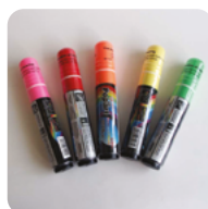
Colour chalkboard marker. 10 mm wide. 5 Pcs. / UYAKLM1251