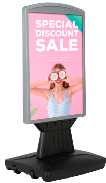
Black-Silver Self adhesive poster