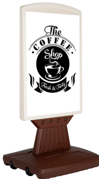
Brown-Beige Self adhesive dry wipe foil