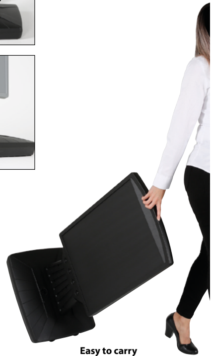
Easy to carry