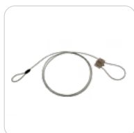
Cable lock kit for WindPro 2100mm. TZZ998701