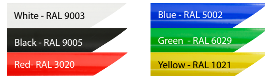
White - RAL 9003 Black - RAL 9005 Red - RAL 3020 Blue - RAL 5002 Green - RAL 6029 Yellow - RAL 1021