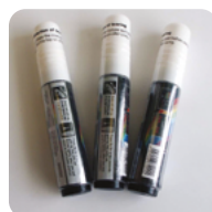
White chalkboard marker for Wood Display. 10 mm wide. 3 Pcs / UYAKLM1250