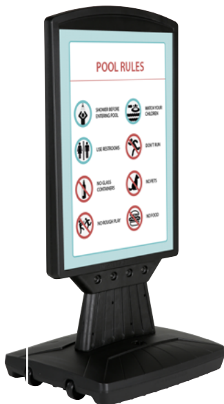
Black-Black Self adhesive poster