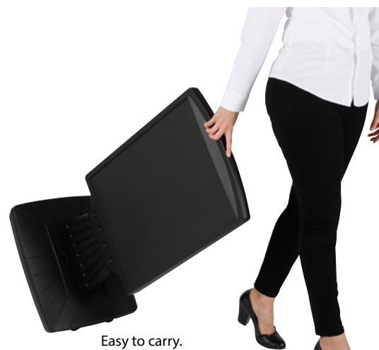
Easy to carry.

Recommended graphic materials: self-adhesive poster to stick-on or vinyl sheeting, fluted PP, metal, Plastech PVC foam board to apply with well nut.