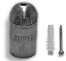
Hanging Kit UYAA001000X5002 2 pcs Ceiling hanger, 2 pcs Wire cable with 1m