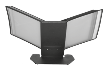
CAUTION: PET Pockets are not included in the pack. Please don't forget to order. Pockets in 3 colours (red, black, gray). Each colour boxed in 10 pcs.