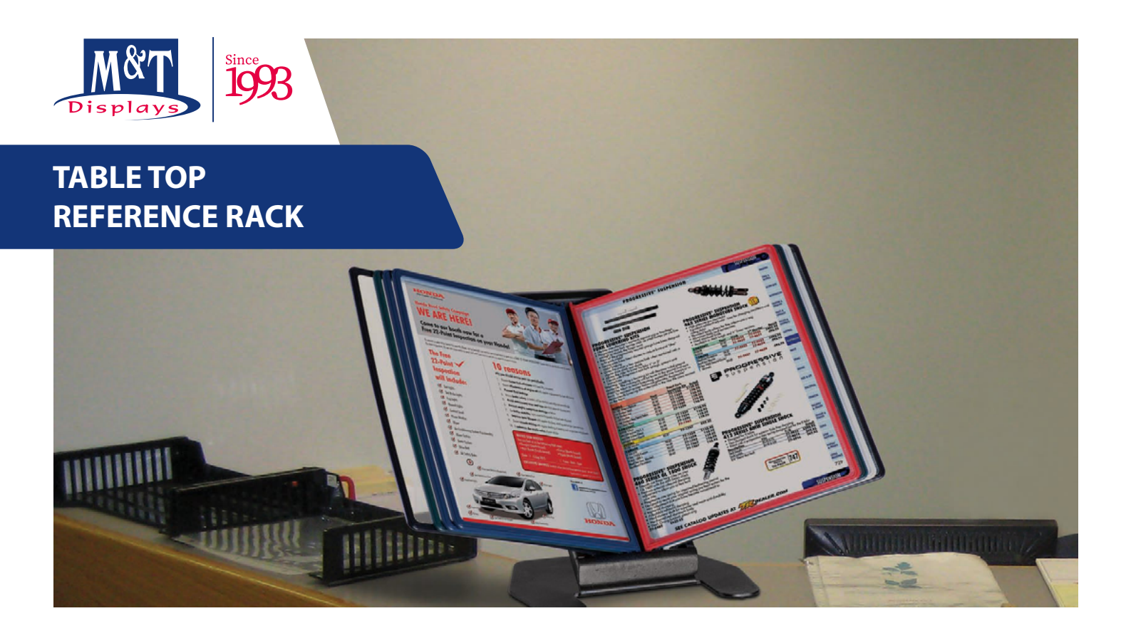
EXHIBIT YOUR POSTERS WITH A BLACK STURDY STEEL RACK

Heavy Rack System with capacity of 10 display pockets. Table Top Reference Rack with a black sturdy steel body, allows you to organize busy environments. Pockets are double sided, allowing you to display 20 pages at a time. 10 x pockets are not included in the system.