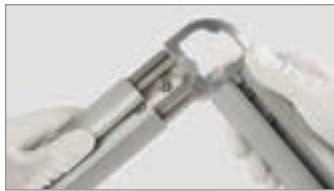
corner bracket made of aluminium injection metallic silver powder coated.