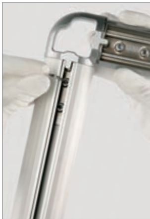
insert and fix with screw