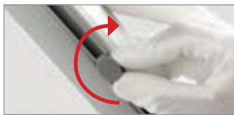
insert banner buttons into the rear channel of the profile