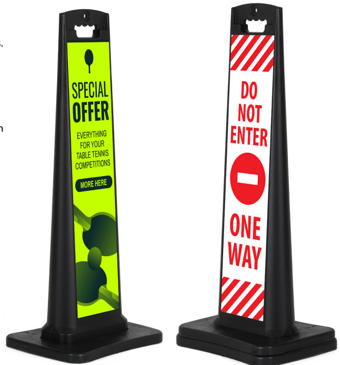
Single 6 kg